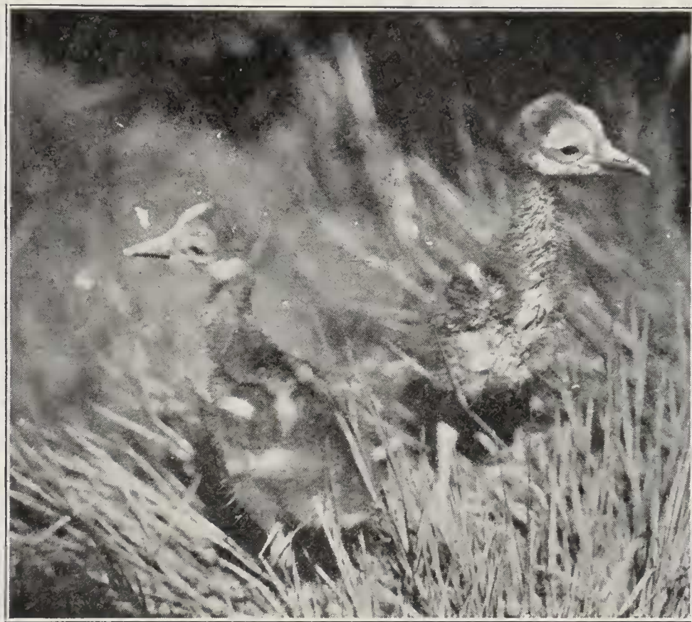
Two Young, Ten Days Old, Sandhill Cranes

Upon a ground color of buffy cream are blotches, spots and specks of soft shades of brown and lavender, quite heavy and confluent at the larger end.